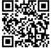
As Brave as You by Jason Reynolds TeachingBooks.net/ql08kco