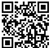
As Brave as You by Jason Reynolds TeachingBooks.net/ql08kco